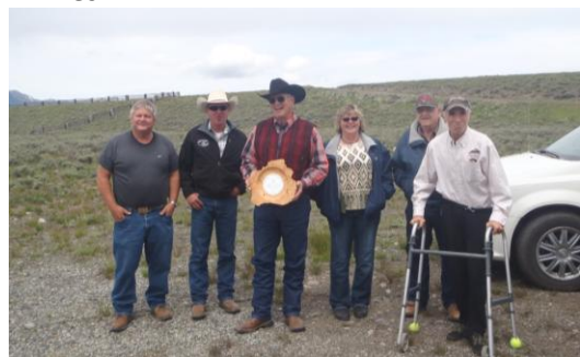
Custer SWCD receives award from SNRA for Excellence in Conservation for Pole Creek. The project will be featured in a Life on the Range Video later this year.