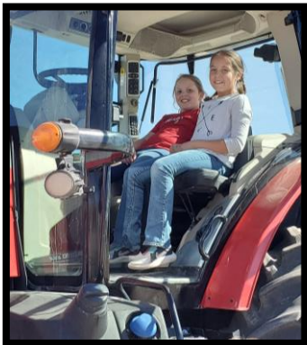
5 th Grade Tour at Parkinson Seed Farm Farm Equipment