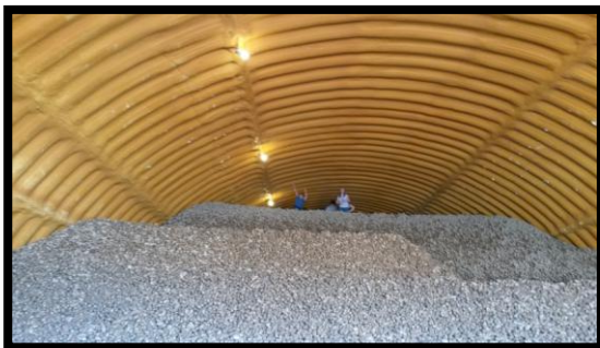
Tour of the Parkinson Seed Farm. Student are on the top of a “mountain” of freshly harvested potatoes.