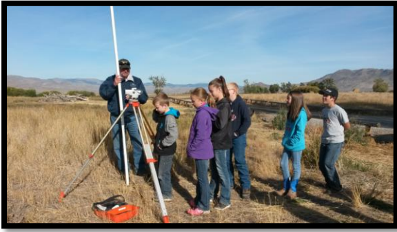
Annual 5 th Grade Tour: Students are given an opportunity to use survey equipment.